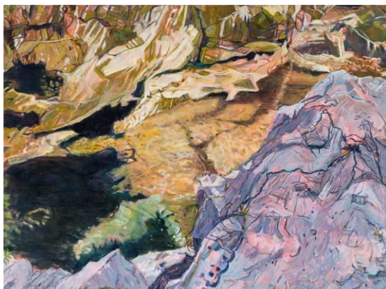
Shelley Haven, Bash Bish Falls Remembered III , 2018. Oil on linen, 30 x 40 in.

March 2–June 29, 2025 at the Derfner Judaica Museum Reception and Artist's Talk: Sunday, May 4, 1:30–3 p.m.