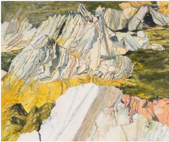
Shelley Haven, Umpachene Remembered I , 2016. Oil on linen, 30 x 36 in.