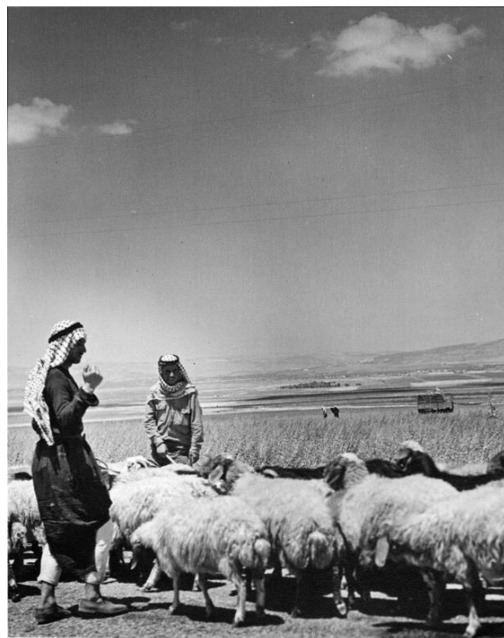
Burt Allen Solomon, West Bank , 1968, gelatin silver print, 9 3/4 x 7 3/4 inches (1968.0)