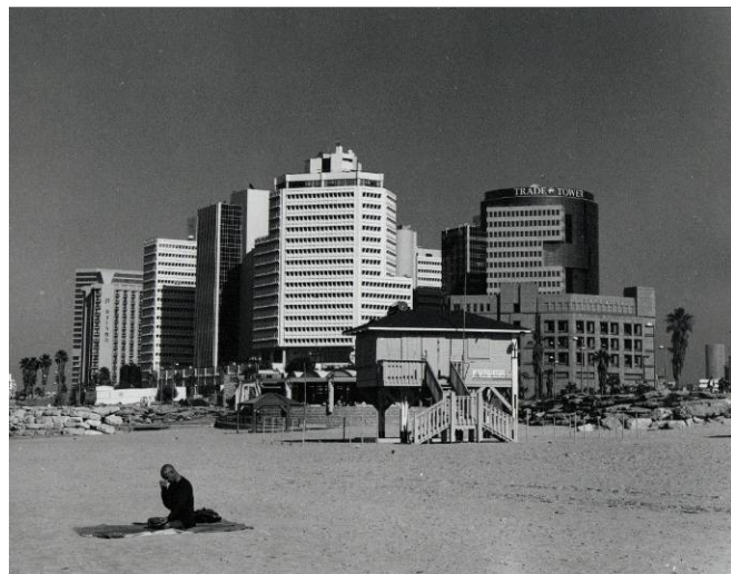
Burt Allen Solomon, Tel Aviv , 2009, gelatin silver print, 7 ¾ x 9 ¾ inches (2009.1)

The exhibition features a selection of 42 black-and-white photographs taken at intervals over a forty-year period from the Mediterranean Sea to across the Green Line, Israel's pre-1967 border. Solomon began photographing in Israel in 1968 – arriving days after an El Al hijacking. His images capture the shifts in Israeli culture, fixing them in gestures, lights, shadows and contrasts. With rare exceptions, his images are untitled, encouraging audiences to look and not to be directed toward a particular viewpoint. "My view is that photographs should first stand on their own," Solomon said. "Only rarely have I given names to pictures. For example, I gave the ironic title Altneuland (Tel Aviv, 2009.3), after Herzl's book, to a photo contrasting new, multi-story