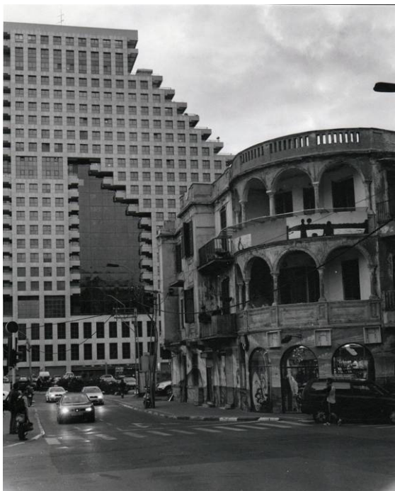
Burt Allen Solomon, "Altneuland" (Tel Aviv), 2009, gelatin silver print, 9 ¾ x 7 ¾ inches (2009.3) © 2013

Opening Reception and Artist's Talk at the Derfner Judaica Museum Sunday, April 14, 3:30-5 p.m.